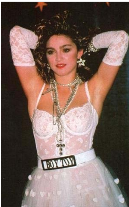
I'd be aiming for a prize in the "Material Girlz" category with this one.