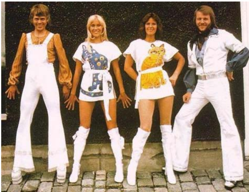
cat mini-dresses! of course!

You know you want to bust out a wicked costume for the event. And if you do, here are the important details: